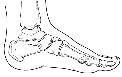
Normal pediatric foot