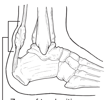
Zone of tendonitis or tendonosis

Achilles tendonitis is an inflammation of the Achilles tendon. This inflammation is typically short-lived. Over time the condition usually progresses to a degeneration of the tendon (Achilles tendonosis), in which the tendon loses its organized structure and is likely to develop microscopic tears. Sometimes the degeneration involves the site where the Achilles tendon attaches to the